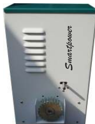
Sliding Gate Motor (4000)