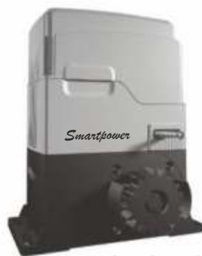
Sliding Gate Motor (1800B & 2500B)