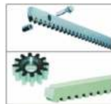
Rack & Pinion