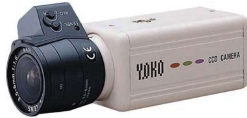
• RYK-275F / 272F / 277F