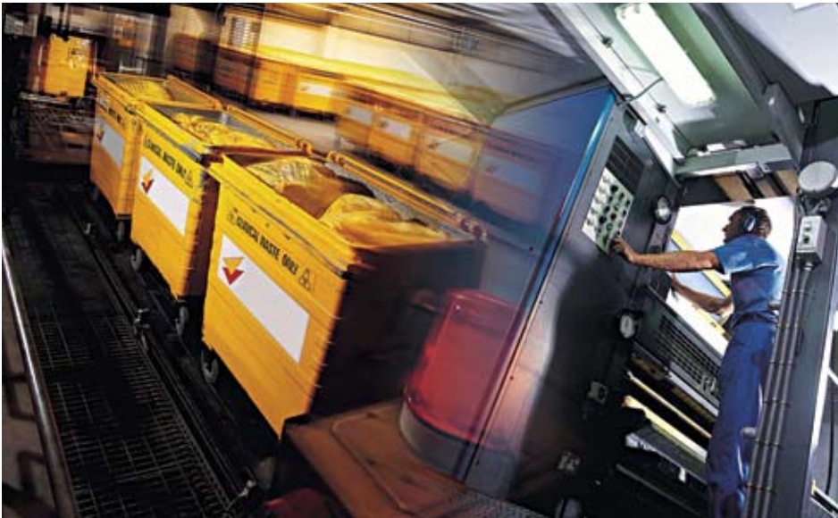
Only Honeywell offers smoke detectors precise enough for high-sensitivity applications and rugged enough for harsh environments.